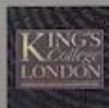
Chairman of Council